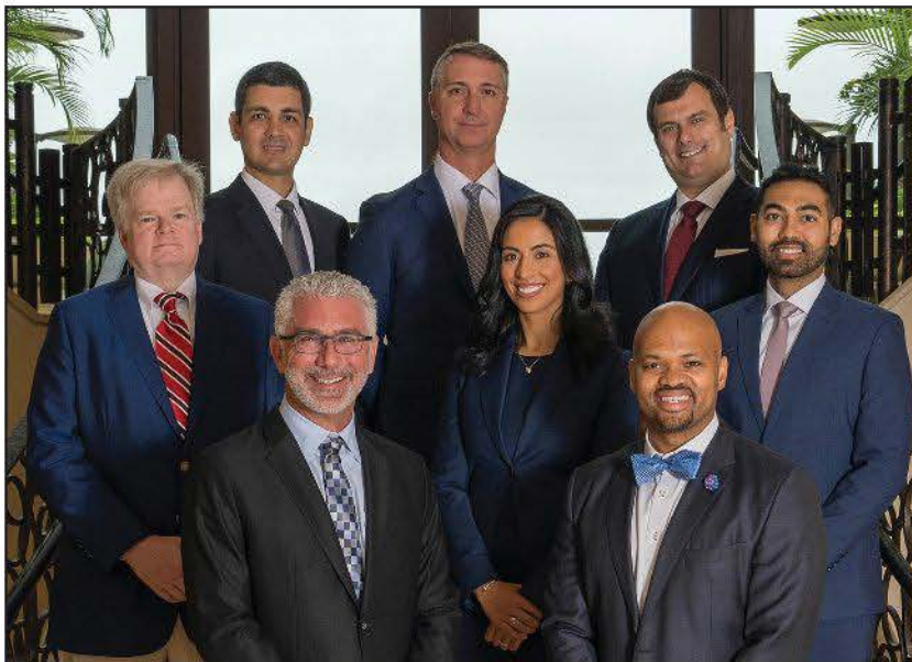
Top Left to Bottom Right: